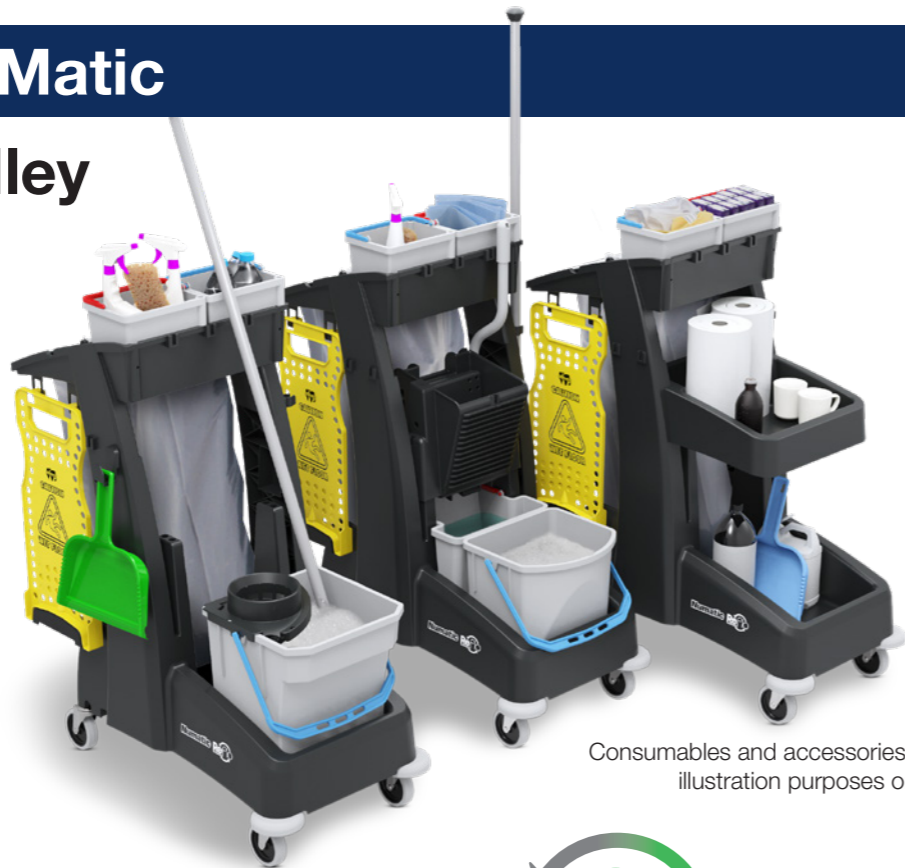
Consumables and accessories for illustration purposes only.

A compact and versatile trolley range, ensuring productivity with a choice of janitorial solutions and mopping options to suit all environments.