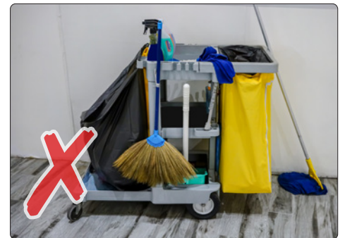
Poor selection and configuration lowers cleaning standards and productivity.